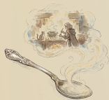
Spoon That Remembers Soup

Things acquired, borrowed, or walked off with aboard the Weeping Mercy