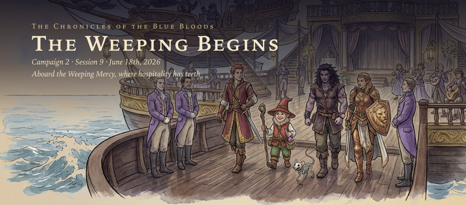
The Weeping Mercy receives the Blue Bloods as honored entertainers.

Aboard the Weeping Mercy, where hospitality has teeth