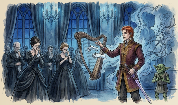
The Grief Salon knew the shape of Art's old wound.