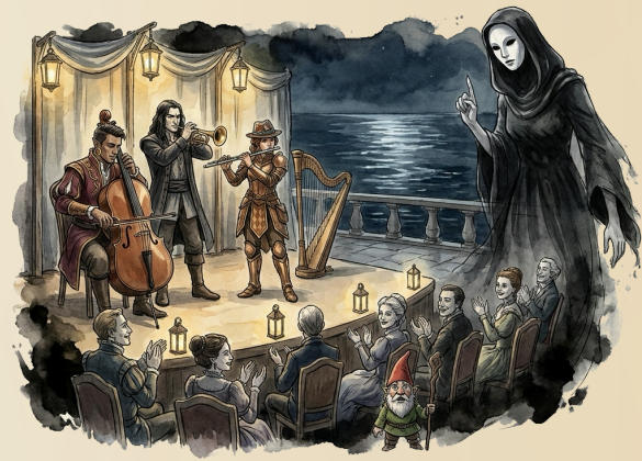
The show begins. The debt comes due.

Going into the performance: payday is still two days away, the Gardener waits after the show, the lower decks are real, and Lady Bleth's language still works. The party has not reached the Conservatory. It has only found the song that points down.